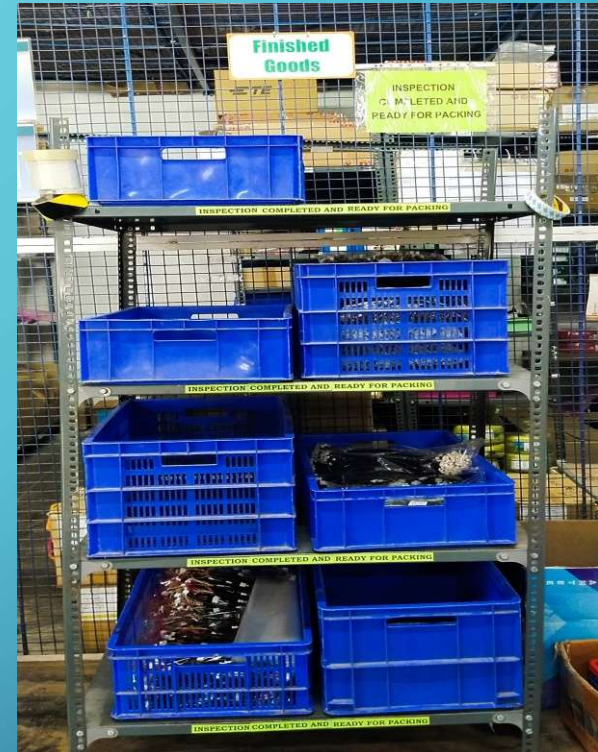
MATERIAL STORAGE PACKING & DISPATCH