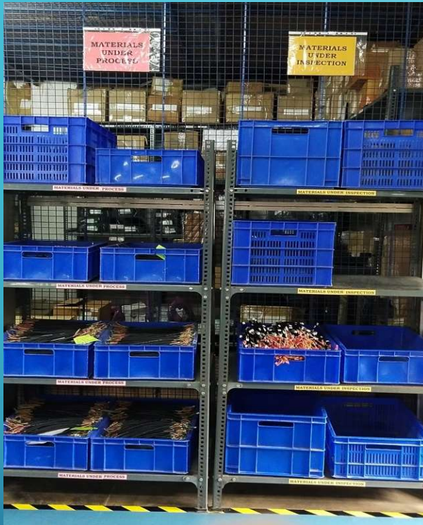
MATERIAL STORAGE PRODUCTION & INSPECTION